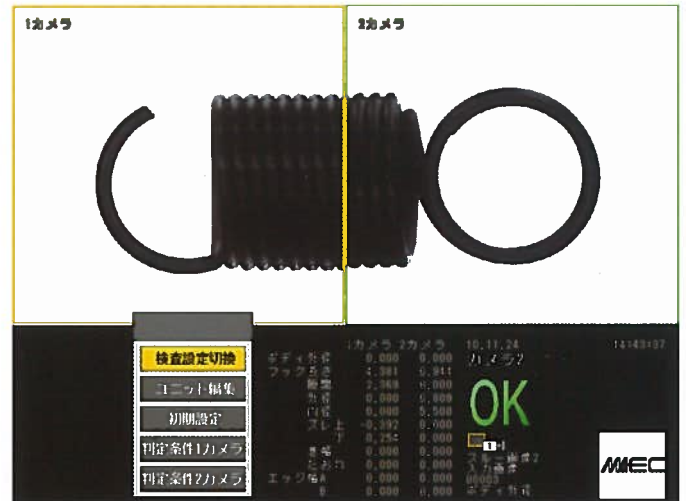
IS-1X setup screen